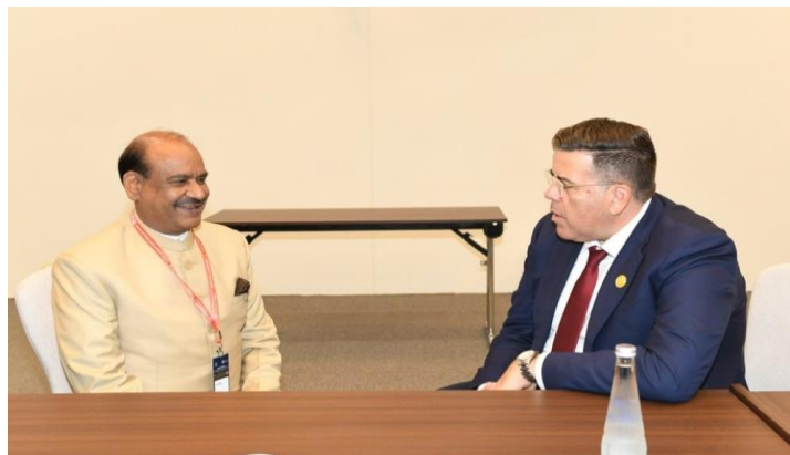
Lok Sabha Speaker Shri Om Birla met Speaker, House of Representatives of Australia H.E. Mr. Milton Dick on the sidelines of 146 th Assembly of the Inter Parliamentary Union on 11 March 2023