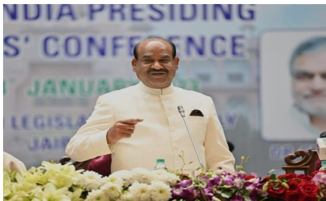
Lok Sabha Speaker Shri Om Birla addressing at the valedictory session of the 83 rd AIPOC at Jaipur on 12 January, 2023