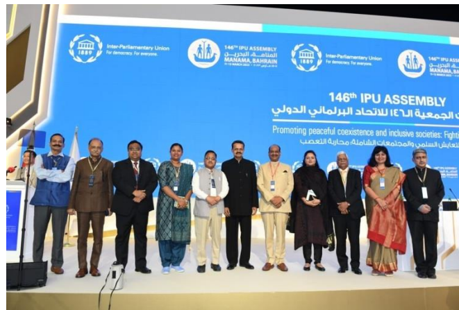
Lok Sabha Speaker Shri Om Birla and Members of Indian Parliamentary Delegation at the Inaugural Session of the 146 th Inter-Parliamentary Union (IPU) Assembly at Manama, Bahrain on 12 March 2023