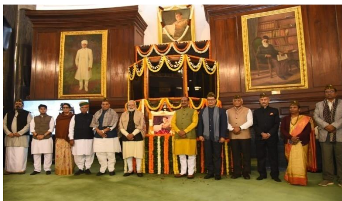
Prime Minister Shri Narendra Modi and Lok Sabha Speaker Shri Om Birla and other Dignitaries after paying floral tributes to Netaji Subhash Chandra Bose on his birth anniversary in Central Hall of the Parliament on 23 January 2023

1. Netaji Subhash Chandra Bose: On the occasion of the birth anniversary of Netaji Subhash Chandra Bose, a function was held on 23 January 2023 in the Central Hall of Parliament House. Prime Minister, Shri Narendra Modi; Lok Sabha Speaker, Shri Om Birla; Several Union Ministers; Leader of Opposition in Rajya Sabha, Shri Mallikarjun Kharge, Members of Parliament and former Members of Parliament paid floral tributes at the portrait of Netaji Subhash Chandra Bose.