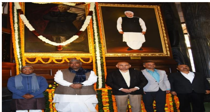
Leader of Opposition in Rajya Sabha Shri Mallikarjun Kharge and Deputy Chairman, Rajya Sabha Shri Harivansh after paying floral tributes to Lala Lajpat Rai in Central Hall of Parliament House on his Birth Anniversary on 28 January 2023

2. Lala Lajpat Rai: On the occasion of the birth anniversary of Lala Lajpat Rai, a function was held on 28 January 2023 in the Central Hall of Parliament House. Leader of Opposition in Rajya Sabha, Shri Mallikarjun Kharge; Deputy Chairman, Rajya Sabha, Shri Harivansh, Members of Parliament and former members paid floral tributes at the portrait of Lala Lajpat Rai.