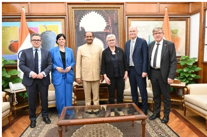
Lok Sabha Speaker Shri Om Birla with the Members of the German-Indian Parliamentary Friendship Group at Parliament House on 31 January 2023