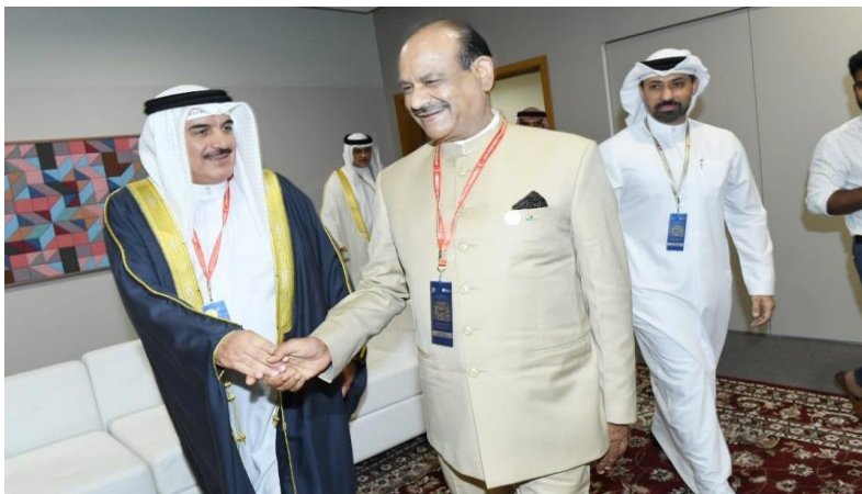
Lok Sabha Speaker Shri Om Birla met H.E. Mr. Ahmed Bin Salman Al Musalam, Speaker of Council of Representatives of Bahrain on the sidelines of 146th Assembly of the Inter-Parliamentary Union on 11 March 2023