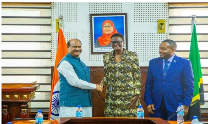
Lok Sabha Speaker Shri Om Birla held fruitful discussions with Speaker of National Assembly of Tanzania H.E. Dr. Tulia Ackson and Speaker of Parliament of Zanzibar H.E. Zubair Ali Maulid on 18 January 2023