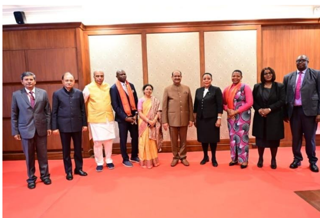
Lok Sabha Speaker Shri Om Birla, Members of Parliament and Secretary - General, Lok Sabha along with the Zambian Parliamentary Delegation in Parliament House Complex on 02 February 2023