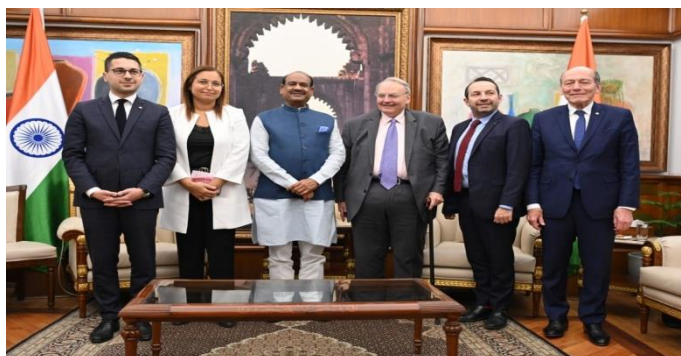
H.E. Mr. Jean -Louis Bourlanges, Chairman of the Committee on Foreign Affairs of the National Assembly of France called on Lok Sabha Speaker Shri Om Birla in Parliament House on 14 March 2023