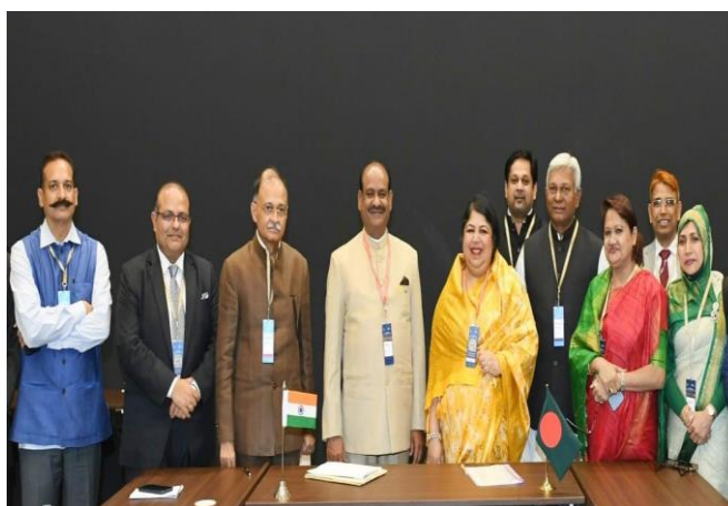
Lok Sabha Speaker Shri Om Birla met H.E. Dr. Shirin Sharmin Chaudhury, Speaker of Jatiyo Sangsad of Bangladesh on the sidelines of 146 th Assembly of the Inter Parliamentary Union on 11 March 2023