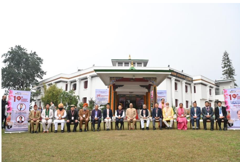
Delegates in a Group Photo during the 19 th Annual Zone III Conference of CPA India Region at Gangtok, Sikkim on 23 February 2023