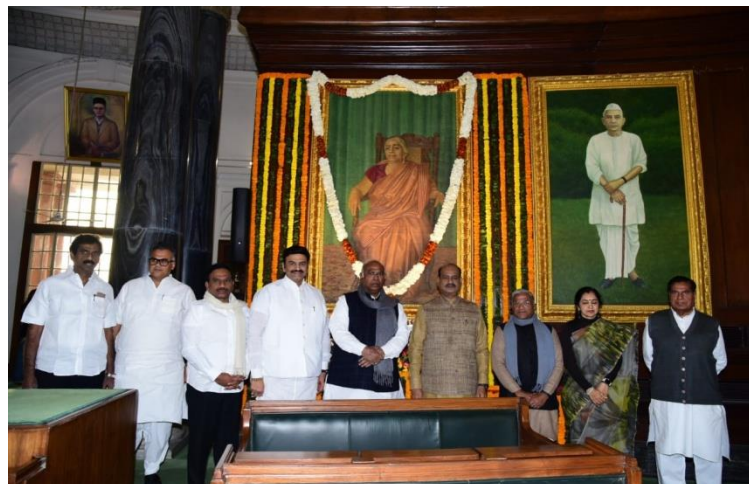
Lok Sabha Speaker, Shri Om Birla; Leader of Opposition in Rajya Sabha, Shri Mallikarjun Kharge; Deputy Chairman Rajya Sabha, Shri Harivansh and Members of Parliament after paying floral tributes at the portrait of Smt Sarojini Naidu, in the Central Hall of Parliament House, on her birth anniversary on 13 February, 2023

4. Smt. Sarojini Naidu: On the occasion of the birth anniversary of Smt. Sarojini Naidu, a function was held on 13 February 2023 in the Central Hall of Parliament House. Lok Sabha Speaker, Shri Om Birla; Leader of Opposition in Rajya Sabha, Shri Mallikarjun Kharge; Deputy Chairman Rajya Sabha, Shri Harivansh, Members of Parliament and former Members paid floral tributes at the portrait of Smt. Sarojini Naidu.