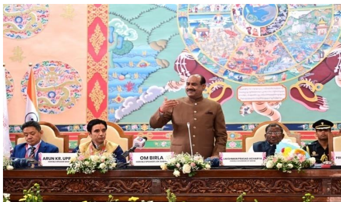
Lok Sabha Speaker Shri Om Birla, addressing at the Valedictory Session of the 19 th Annual Zone III Conference of CPA India Region at Gangtok, Sikkim on 24 February 2023