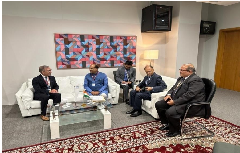
Lok Sabha Speaker Shri Om Birla met President of the Inter Parliamentary Union, Mr. Duarte Pacheco in Manama, Bahrain on the sidelines of the 146 th Assembly of the Inter-Parliamentary Union (IPU) on 10 March 2023

On the sidelines of the Assembly Hon'ble Speaker, Lok Sabha met with H.E. Duarte Pacheco, IPU President. He held bilateral meetings with some of the Presiding Officers of G20 and guest countries under India's G20 Presidency and invited them for the 9 th G20 Parliamentary Speakers' Summit (P20) to be hosted by Parliament of India in 2023.