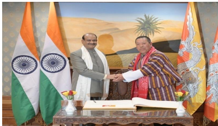
A Parliamentary delegation led by H.E Wangchuk Namgyel, Speaker of the National Assembly of Bhutan met Lok Sabha Speaker, Shri Om Birla at the Parliament House Complex on 06 February 2023