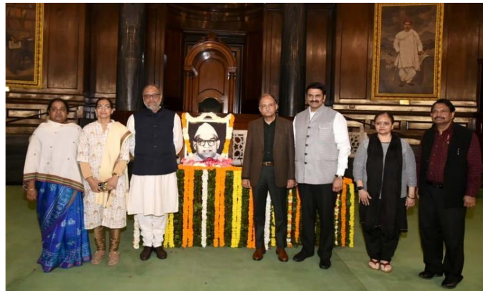
Dignitaries after paying floral tributes to former Lok Sabha Speaker, Shri M. Ananthasayanam Ayyangar , in the Central Hall of Parliament House, on his birth anniversary on 4 February, 2023

3. Shri M. Ananthasayanam Ayyangar: On the occasion of the birth anniversary of Shri M. Ananthasayanam Ayyangar, a function was held on 4 February 2023 in the Central Hall of Parliament House. Parliamentarians paid floral tributes at the portrait of the former Speaker of Lok Sabha, Shri M. Ananthasayanam Ayyangar.