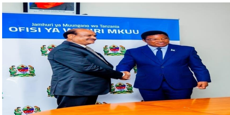
Lok Sabha Speaker Shri Om Birla met Hon'ble Prime Minister of Tanzania, H.E. Mr. Kassim Majaliwa on 19 January, 2023