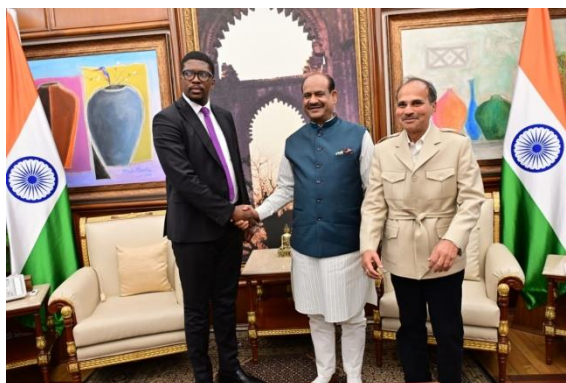
Lok Sabha Speaker Shri Om Birla and Shri Adhir Ranjan Chowdhary, MP with Mr. Mkhuleko Hlengwa, Chairman, Public Accounts Committee of the Parliament of the Republic of South Africa in Parliament House on 3 February 2023.