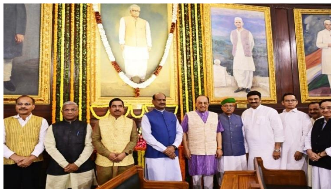
Lok Sabha Speaker, Shri Om Birla and other dignitaries after paying floral tributes at the portrait of Dr. Ram Manohar Lohia in the Central Hall of Parliament House on his birth anniversary on 23 March, 2023

6. Dr. Ram Manohar Lohia: On the occasion of the birth anniversary of Dr. Ram Manohar Lohia, a function was held on 23 March 2023 in the Central Hall of Parliament House. Lok Sabha Speaker, Shri Om Birla; Union Minister for Parliamentary Affairs, Coal and Mines, Shri Pralhad Joshi; Minister of Law and Justice, Shri Kiren Rijiju; Leader of Opposition in Rajya Sabha, Shri Mallikarjun Kharge; Deputy Chairman, Rajya Sabha, Shri Harivansh, Members of Parliament and former Members of Parliament paid floral tributes to Dr. Ram Manohar Lohia.