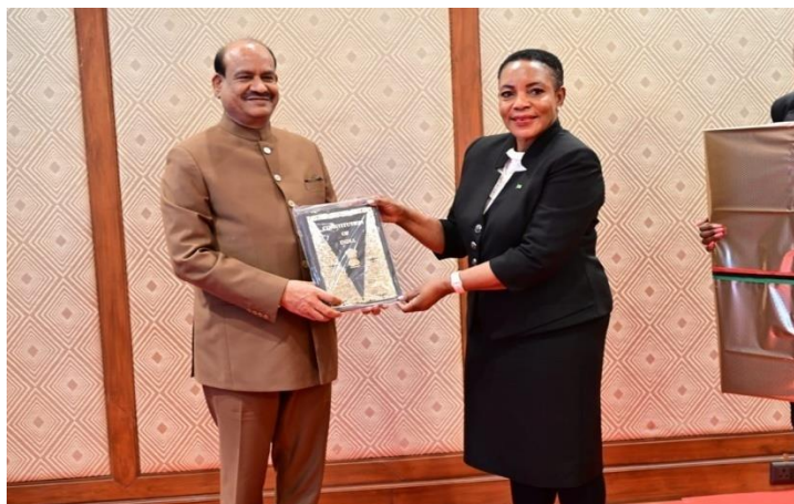
Parliamentary delegation led by the Speaker of the National Assembly of the Republic of Zambia, H.E. Ms. Nelly Butete Mutti, met Lok Sabha Speaker, Shri Om Birla at the Parliament House Complex on 2 February 2023

1. ZAMBIA: A Parliamentary Delegation led by Hon. Ms. Nelly Butete Mutti, Speaker of the National Assembly of the Republic of Zambia visited India from 1 to 5 February, 2023. On 02 February the delegation called on Smt. Droupadi Murmu, Hon'ble President of India and Shri Jagdeep Dhankhar, Hon'ble Vice President of India & Chairman, Rajya Sabha. On the same day, Shri Om Birla, Hon'ble Speaker, Lok Sabha and the visiting Speaker held bilateral Parliamentary dialogue, which was followed by a banquet lunch. The delegation also witnessed the proceedings of Lok Sabha and Rajya Sabha from the 'Special Box'. Besides Delhi, the delegation also visited Agra.