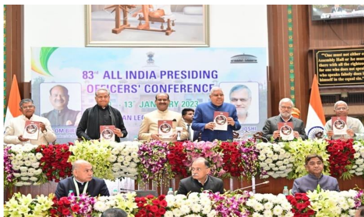
Vice President of India and Chairman, Rajya Sabha Shri Jagdeep Dhankhar and to his right Lok Sabha Speaker Shri Om Birla; Chief Minister of Rajasthan Shri Ashok Gehlot; Shri Gulab Chand Kataria, Leader of Opposition, Rajasthan Vidhan Sabha; and to the left of Hon'ble VP Speaker, Rajasthan Vidhan Sabha, Dr. C. P. Joshi and Deputy Chairman, Rajya Sabha, Shri Harivansh releasing updated edition of Presidential Addresses to Parliament published by Lok Sabha Secretariat during the inaugural session of the 83 rd All India Presiding Officers' Conference on 11 January 2023.

On 11 January 2023, Shri Jagdeep Dhankar, Hon'ble Vice-President and Chairman, Rajya Sabha inaugurated and addressed the Conference. Shri Om Birla, Hon'ble Speaker, Lok Sabha and Chairperson, AIPOC; Shri Harivansh, Deputy Chairman, Rajya Sabha; Shri Ashok Gehlot, Chief Minister, Rajasthan; Dr. C.P. Joshi, Speaker, Rajasthan Vidhan Sabha, and Shri Gulab Chand Kataria, Leader of Opposition, Rajasthan Vidhan Sabha, also addressed the Inaugural Session of the Conference. The messages by Hon'ble Prime Minister Shri Narendra Modi and Shri Mallikarjun Kharge, Leader of Opposition, Rajya Sabha were also read out by Dr. C.P. Joshi, Speaker, Rajasthan Vidhan Sabha during the Inaugural Session. The Conference was attended by 35 Presiding Officers (including Chairmen/ Speakers/ Deputy Chairmen/ Deputy Speakers) of the State / Union Territory Legislatures.