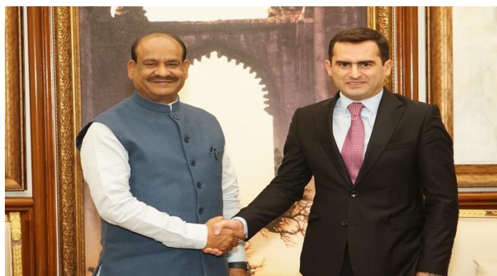
H.E. Mr. Hakob Arshakyan, Vice President of the Armenian National Assembly & Chairman of the India-Armenia Parliamentary Friendship Group called on Lok Sabha Speaker Shri Om Birla in Parliament House on 2 March 2023