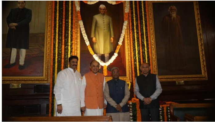
Dignitaries after paying floral tributes to Shri Morarji Desai, former Prime Minister, in the Central Hall of Parliament House, on his birth anniversary on 28 February, 2023

5. Shri Morarji Desai: On the occasion of the birth anniversary of Shri Morarji Desai, a function was held on 28 February 2023 in the Central Hall of Parliament House. Parliamentarians paid floral tributes at the Portrait of Shri Morarji Desai.