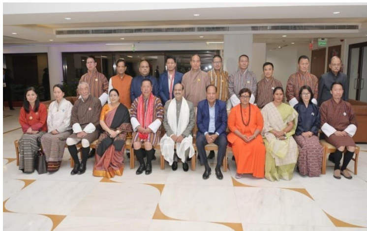
A Parliamentary delegation led by the Speaker of the National Assembly of Bhutan, H.E. Mr. Wangchuk Namgyel met Lok Sabha Speaker, Shri Om Birla at the Parliament House Complex on 6 February 2023

2. BHUTAN: A Parliamentary Delegation led by H.E. Mr. Wangchuk Namgyel, Hon'ble Speaker of the National Assembly of Bhutan visited India from 5 to 11 February, 2023. On 06 February the delegation called on Shri Jagdeep Dhankhar, Hon'ble Vice President of India & Chairman, Rajya Sabha. On the same day, visiting Speaker held bilateral Parliamentary dialogue with Shri Om Birla, Hon'ble Speaker, Lok Sabha and a Memorandum of Understanding (MoU) was signed to enhance parliamentary cooperation that was followed by a cultural programme and a banquet dinner. The delegation also witnessed the proceedings of Lok Sabha and Rajya Sabha from the 'Special Box' on the same day. On 07 February, the delegation called on Smt. Droupadi Murmu, Hon'ble President of India and met with Dr. Subrahmanyam Jaishankar, Hon'ble Minister of External Affairs. Besides Delhi, the delegation also visited Bodh Gaya, Mumbai and Aurangabad.