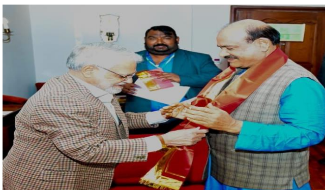
Lok Sabha Speaker Shri Om Birla being greeted by Speaker of the Rajasthan Vidhan Sabha Dr. CP Joshi at Jaipur on 10 January 2023. Shri Birla Chaired the 83 rd AIPOC at Jaipur on 11 and 12 January, 2023.

The 83 rd All India Presiding Officers' Conference (AIPOC) was held on 11 and 12 January 2023 at Rajasthan Vidhan Sabha, Jaipur.