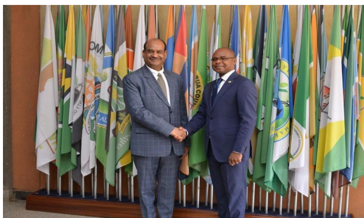
Lok Sabha Speaker Shri Om Birla with the Speaker of the Senate, Rt. Hon'ble Mr. Amason Jeffah Kingi during his visit to Kenya on 17 January, 2023

On 18 January, the delegation reached Tanzania. The delegation visited the Commonwealth War Cemetery where Hon'ble Speaker and Members of the delegation paid respects to the Indian soldiers who had lost their lives in World War-I. A Bilateral Parliamentary Dialogue took place between Hon'ble Speaker, Lok Sabha and H.E. Dr. Tulia Ackson, Speaker of Parliament of Tanzania. H.E. Mr. Zubair Ali Maulid, the Speaker of the House of Representatives of Zanzibar was also present during the dialogue. The High Commission of India in Dar es Salaam had organized the interactions of the delegation with Tanzanian alumni of Indian Universities and with the Indian community. Hon'ble Speaker addressed both the gatherings. On 19 January, the Delegation had a meeting with H.E. Mr. Kassim Majaliwa Majaliwa, Prime Minister of Tanzania. The Parliament of Tanzania on 20 January organized a cultural tour for the Delegation to Serengeti National Park. The Delegation had a brief interaction with H.E. Dr. Stergomena Lawrence Tax, Minister of Foreign Affairs and East African Cooperation on 21 January 2023 prior to their departure for New Delhi.