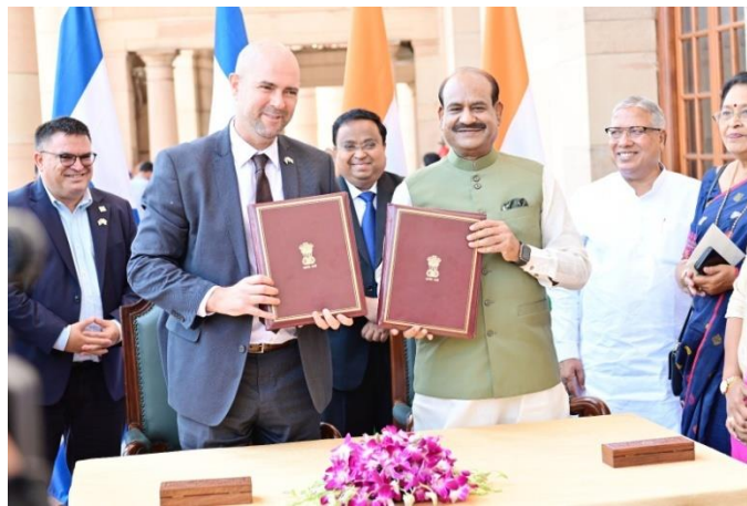
H.E. Mr. Amir Ohana, Speaker of the Knesset (Parliament) of Israel and Lok Sabha Speaker Shri Om Birla signed a Memorandum of Understanding on 31 March 2023 in Parliament House for strengthening parliamentary

3. ISRAEL: A Parliamentary Delegation led by H.E. Mr. Amir Ohana, Hon'ble Speaker of the Knesset of the State of Israel visited India from 31 March to 4 April, 2023. On 31 March, the delegation called on Smt. Droupadi Murmu, Hon'ble President of India and Shri Jagdeep Dhankhar, Hon'ble Vice President of India & Chairman, Rajya Sabha. On the same day, the visiting Speaker held bilateral Parliamentary dialogue with Shri Om Birla, Hon'ble Speaker, Lok Sabha and a Memorandum of Understanding (MoU) was signed in order to enhance parliamentary interaction and exchanges that was followed by a cultural programme and a banquet lunch. On the same day, a Show round of Parliament House Complex was organized for the visiting delegation. On 3 April, the delegation met with Dr. Subrahmanyam Jaishankar, Hon'ble Minister of External Affairs. Besides Delhi, the delegation also visited Agra and Mumbai. At Mumbai, the visiting delegation called on Shri Ramesh Bais, Hon'ble Governor of Maharashtra and also met Hon'ble Speaker, Maharashtra Legislative Assembly, Shri Rahul Narwekar before their departure for Israel.