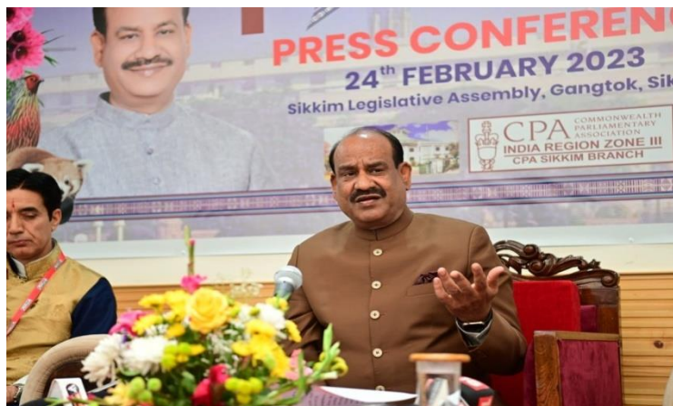
Lok Sabha Speaker Shri Om Birla, at a Media interaction after the Valedictory Session of the 19 th Annual Zone III Conference of CPA India Region at Gangtok, Sikkim on 24 February 2023

The 19 th Annual Zone-III Conference of Commonwealth Parliamentary Association (CPA) India Region was held from 22 to 26 February 2023 at Gangtok, Sikkim.