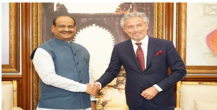
Mr. Morten Løkkegaard, Member of European Parliament & Chair, European Parliament's Delegation for Relations with India called on Lok Sabha Speaker Shri Om Birla in Parliament House on 2 March, 2023