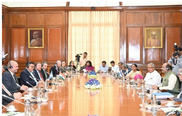
An Israeli Parliamentary Delegation led by H.E. Mr. Amir Ohana, Speaker of the Knesset (Parliament) of Israel met Lok Sabha Speaker Shri Om Birla on 31 March, 2023